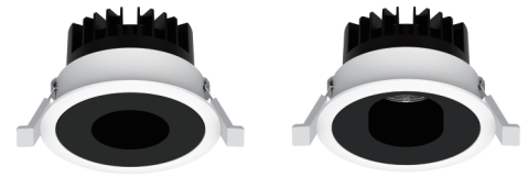
Small circular hole

* This optical design reduces luminous efficacy by about 20%.